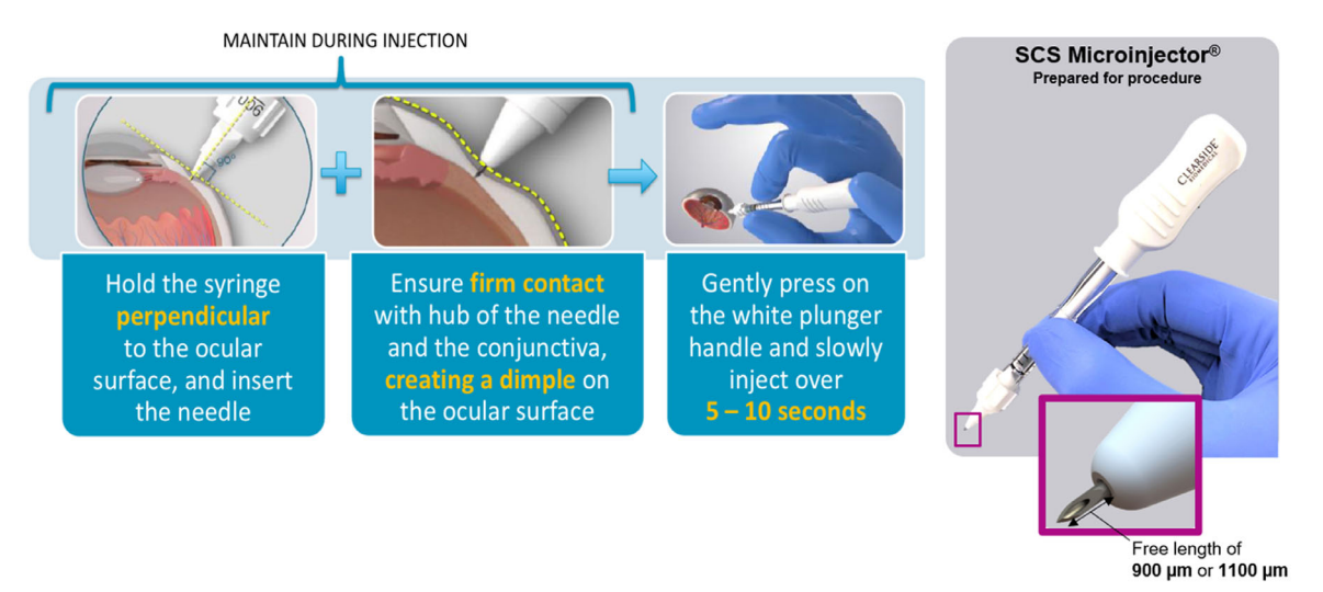
Figure 1. Key suprachoroidal injection techniques. The needle must be inserted perpendicularly to the ocular surface because the free needle length is on the order of the thickness of the sclera. The needle hub is designed to compress on the ocular surface to reduce the thickness of the conjunctiva and to form an indentation. Because the SCS, a potential space, is opened as the injection occurs, slow injection is essential once loss of resistance is experienced. It is recommended for the physician to first attempt the SC injection with the shorter needle. The two needle lengths of 900 \mu m and 1100 \mu m are offered to accommodate variations in patient anatomy. If persistent resistance is felt, then the longer needle may be used to complete the injection, after ensuring appropriate injection technique.